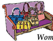
Women of Grace

Donuts will be made on Wednesday, September 7th and 21st. Please call 218-233-1857 to place your orders. Donuts are to be picked up between 8:00 am and noon. The last day to place your order is the Monday before donuts are made. There is also a sign up sheet in the Narthex.