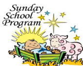
Sunday School Program

The children's Christmas program is Sunday, December 21st during the regular worship service.