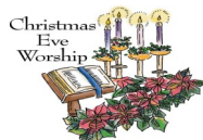
Christmas Eve Worship

Christmas Eve Service is Wednesday, December 24th at 5:00 P.M.