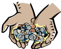
Tithes and offerings

All donations must be received in the office by 10:00 Am , on December 31, 2014 to be counted as a 2014 contribution. All contributions received after that date will be counted as a 2015 contribution.